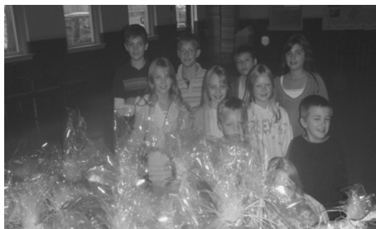
The Sunday School assembled Thanksgiving baskets for the senior members of United and shut-ins on November 16 th .